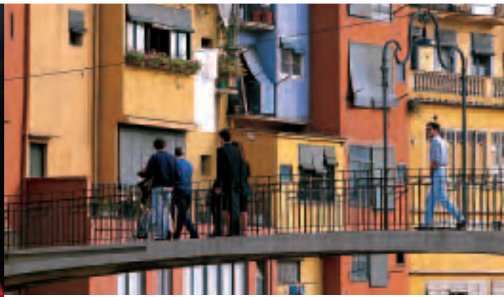
GIRONA (COSTA BRAVA)