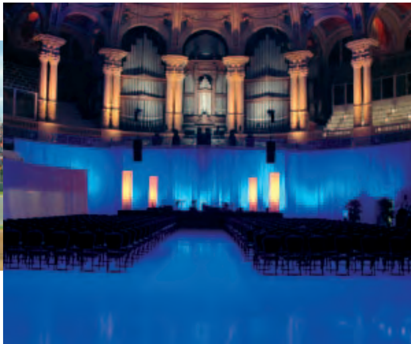
MUSEU NACIONAL D'ART DE CATALUNYA (BARCELONA)