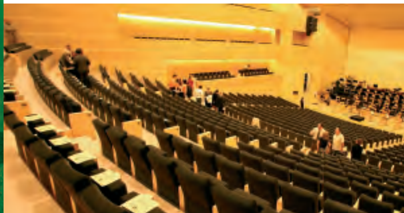
AUDITORIUM AND CONFERENCE CENTER - GIRONA (COSTA BRAVA)

Catalan cuisine has become firmly established in recent years as a reference point, both in the Mediterranean area and at world level. Catalan chefs, such as Ferran Adrià, Carme Ruscalleda, Carles Gaig, Sergi Arola and Santi Santamaria, amongst others, have become well-known the world over. The 2006 Spain-Portugal Michelin Guide has granted five new stars to Catalan restaurants this year. Catalonia boasts now a total of 46 stars.