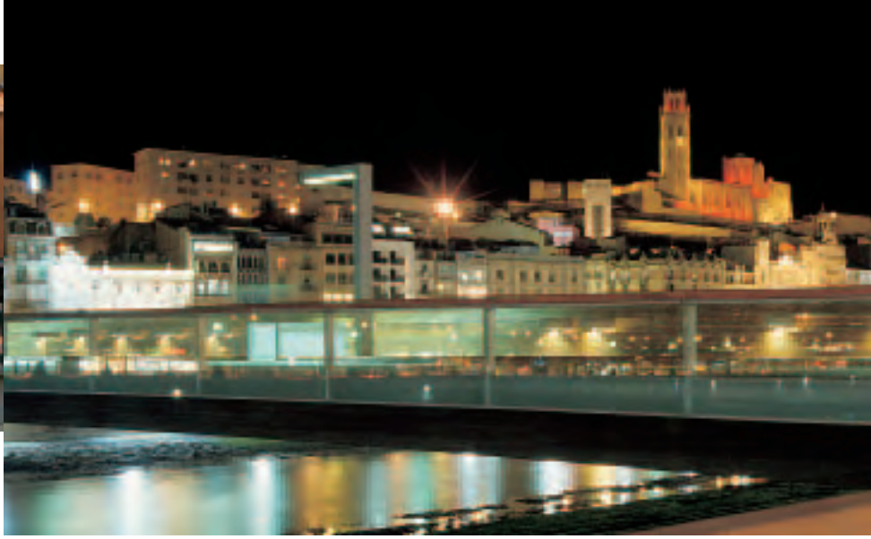
LLEIDA (TERRES DE LLEIDA)

Located on the Mediterranean, in the heart of the Costa Daurada, Tarragona is Catalonia's southernmost capital city, less than 100 kilometres away from Barcelona. Its privileged location affords it a temperate and mild climate all year round. The declaration of its archaeological Roman ruins as UNESCO World Heritage is proof of this legacy. Monuments, location and climate make Tarragona an exceptional destination, one where visitors can play golf or tennis, ride on horseback or sail... These activities can be wisely combined with a taste of the city's gastronomy and a stint at its shopping offer.