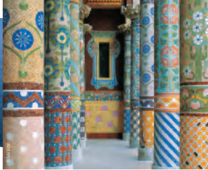
PALAU DE LA MUSICA CATALANA (BARCELONA)