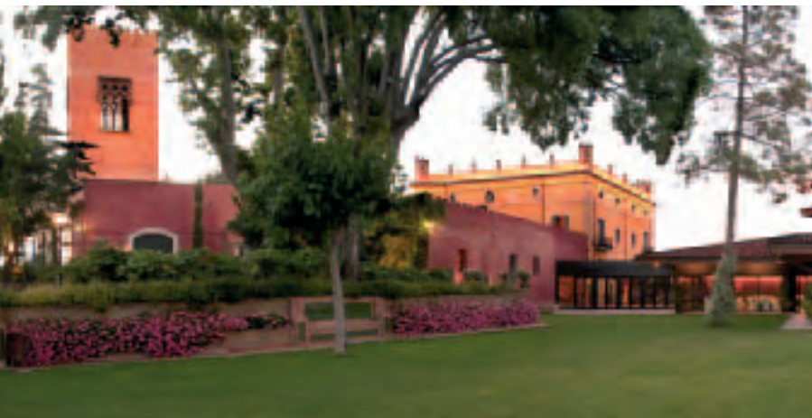
LA BOELLA (COSTA DAURADA)