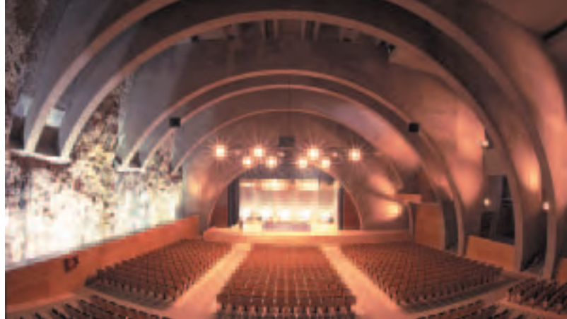
TRADE FAIR AND CONGRESS CENTRE - TARRAGONA (COSTA DAURADA)