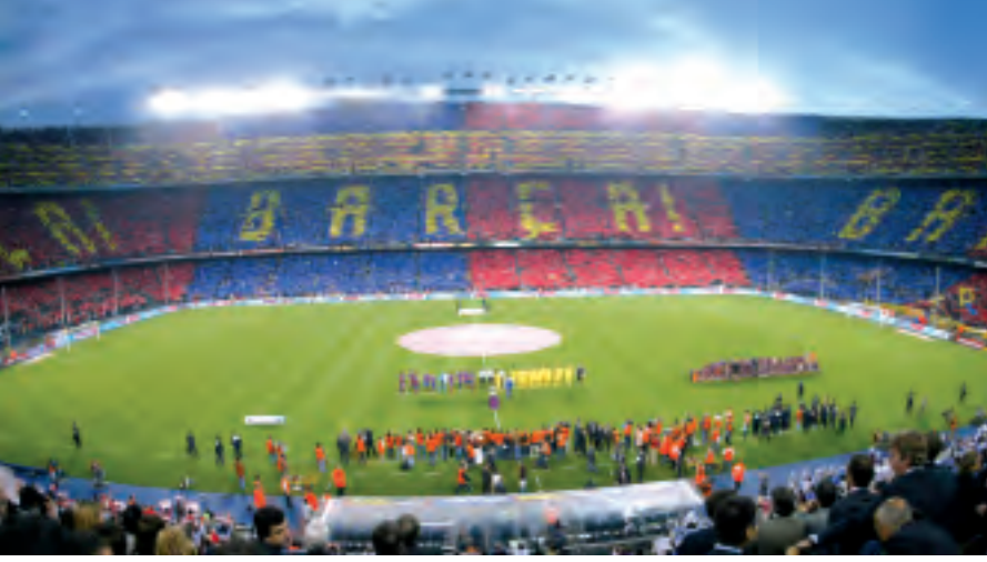
FOOTBALL CLUB BARCELONA