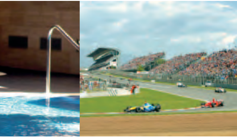
CIRCUIT DE CATALUNYA (CATALUNYA CENTRAL)