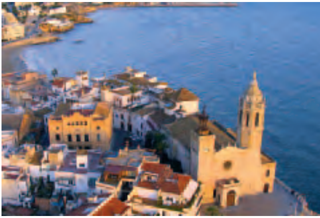
SITGES (COSTA DEL GARRAF)